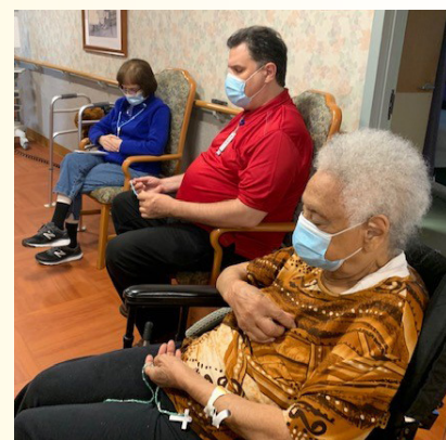
Residents pray the rosary.

From the bottom of our hearts, we want to thank you for being an integral part of Mary Immaculate.